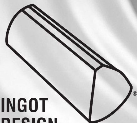
INGOT DESIGN BRIQUET

NET WEIGHT: 17.7 LBS (8 KG) CONTAINS 220 BRIQUETS