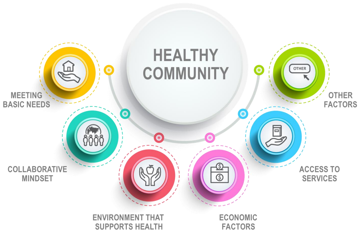
Figure 1. Key Features of a Healthy Community, Onondaga County, 2016

Responses about characteristics for achieving a healthy community focused around six main themes: meeting basic needs, collaborative mindset, environment that supports health, economic factors, access to services, and other factors (Figure 1).