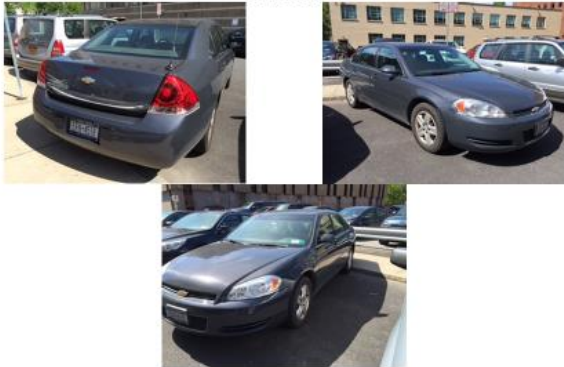
District Attorney #1 2008 Chevrolet Impala 2141