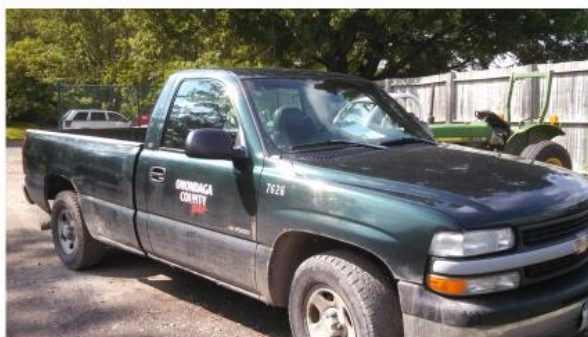
Parks and Recreation #3 2001 Chevrolet Silverado #7626 Vehicle Removed from Service in 2015