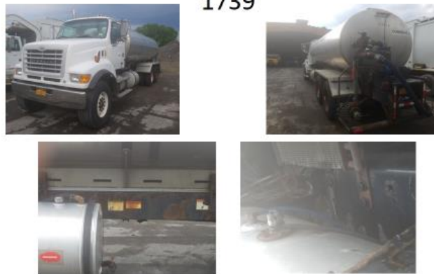
WEP # 2 2005 Sterling Tanker 1739