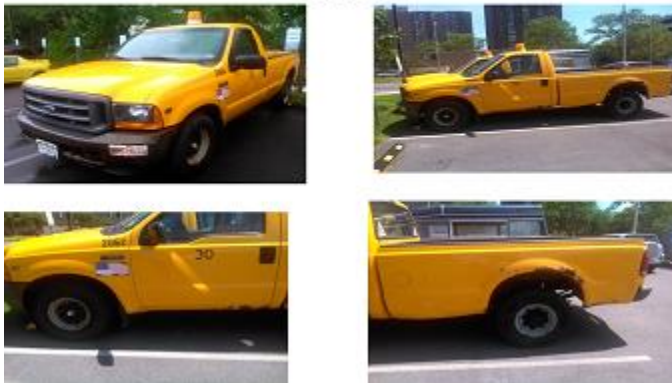
Facilities #1 2001 Ford 250 2062

Mr. Wixson: Today we’re here to ask for the replacement of a 2001 Ford pickup with a new one. Current pickup has 139,000 miles and is in poor shape and it was a hand me down