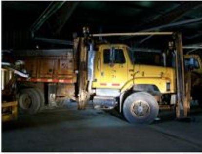
Transportation #3 Inter., 6 Wheel Dump 1999 71