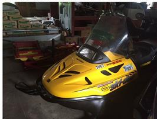
2003 Skidoo Skandic Snowmobile