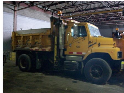
Transportation #6 Inter., 6 Wheel Dump 1999 54