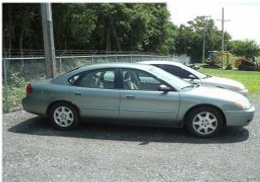
Sheriffs Ford Taurus