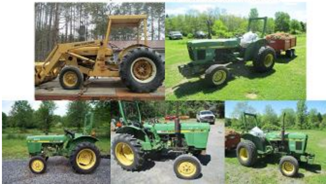
1983 & 1985 John Deere 850 Compact Tractors, 1983 Ford 545 Loader