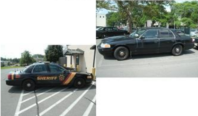
Sheriffs Ford Crown Victoria