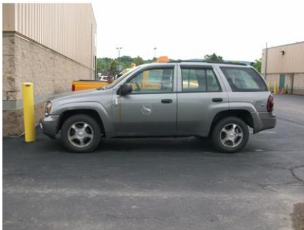
Transportation #9 2008 Chevy Trailblazer 8