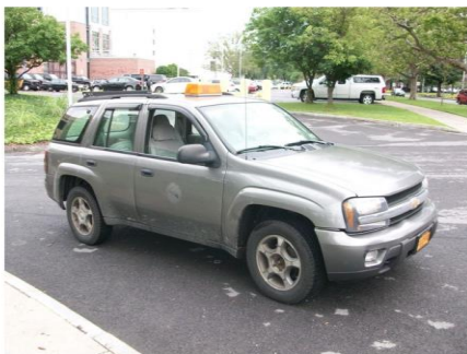
Transportation # 11 2008 Chevy Trailblazer 31