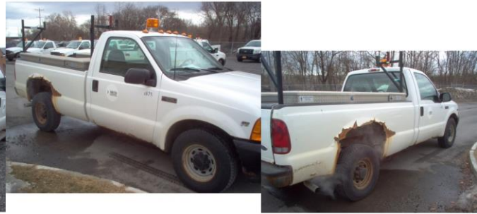
WEP # 12 2001 Ford F250 1675