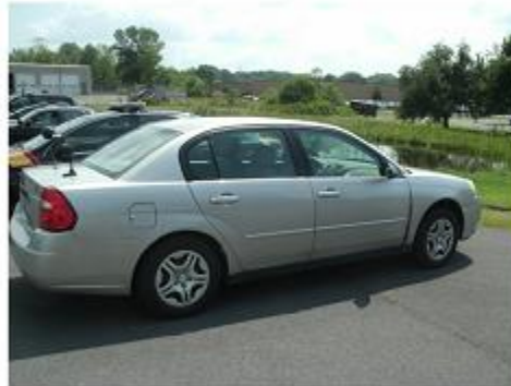
Sheriffs 2007 Chevy Malibu