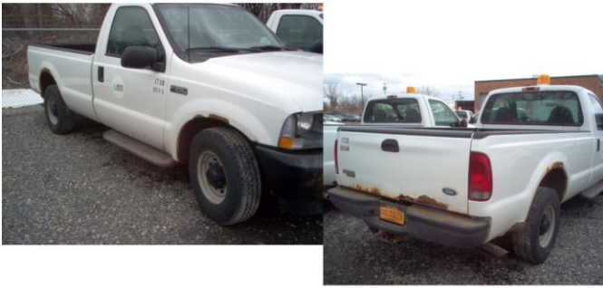
WEP # 11 2003 Ford F250 1730