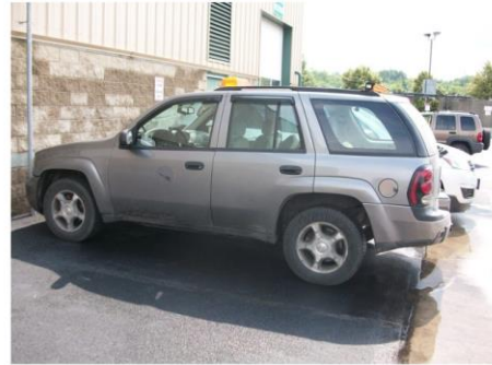
Transportation #8 2008 Chevy Trailblazer 5