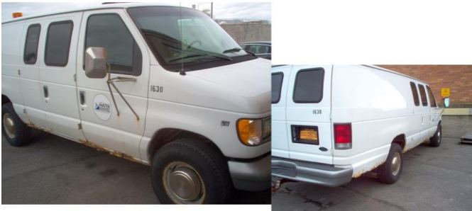
WEP # 13 1998 Ford E250 1630