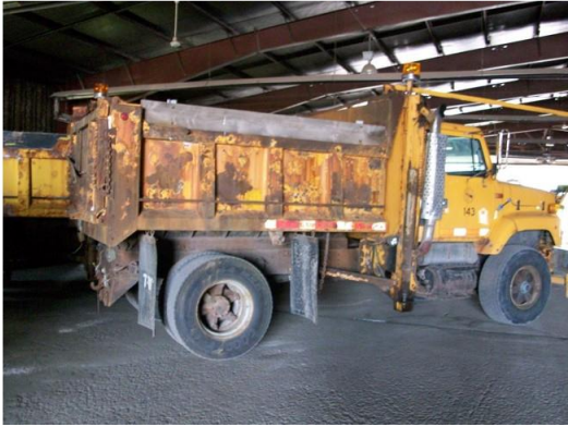
Transportation #7 Inter., 6 Wheel Dump 1999 143