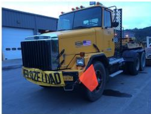
Transportation #1 1991 GMC 180