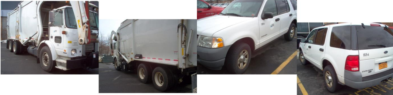
WEP # 2 2002 Ford Explorer 1694