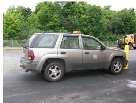
Transportation #10 2008 Chevy Trailblazer 15