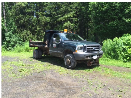
2002 F350 Dump Truck