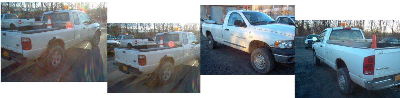
WEP # 4 2005 Dodge 2500 4x4 1748