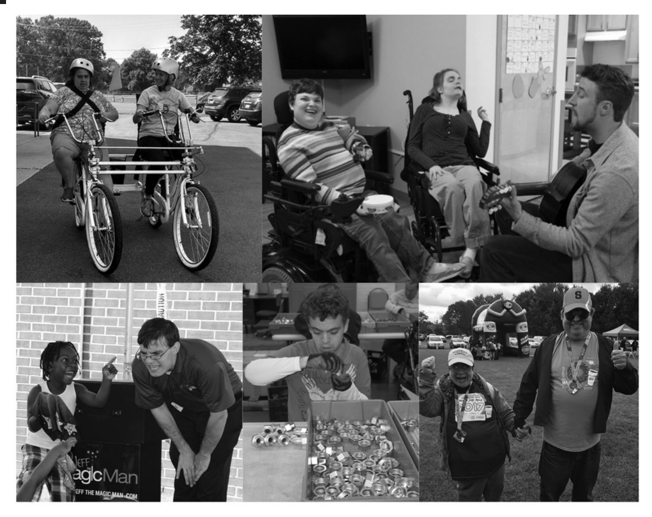
Independence. Employment. Education. Opportunity. Inclusion.